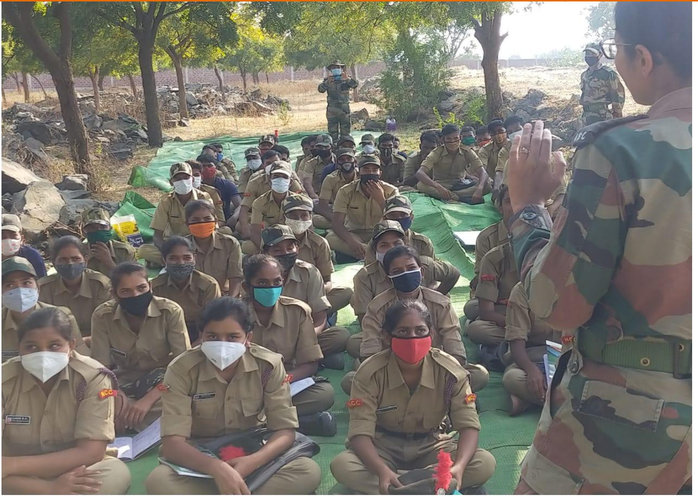
REFRESHMENT FOR CADETS