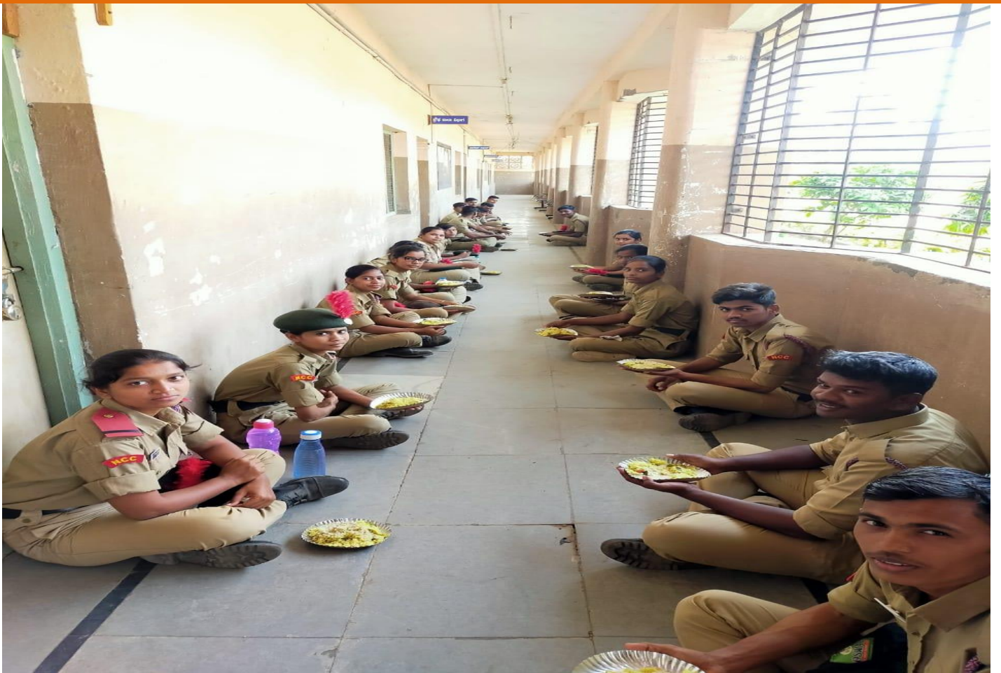
END OF THE CAMP FELICITATION PROGRAMME