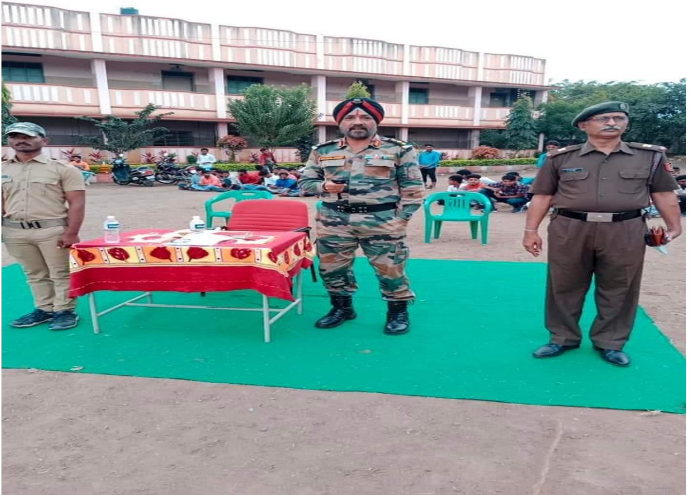
ATC CAMP VIJAYAPUR