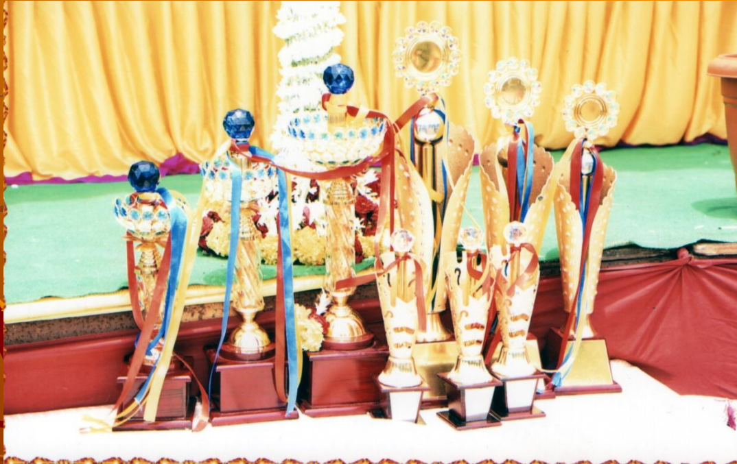
RCUB Belagavi Jounal and Inter Junal Tournament (Men)