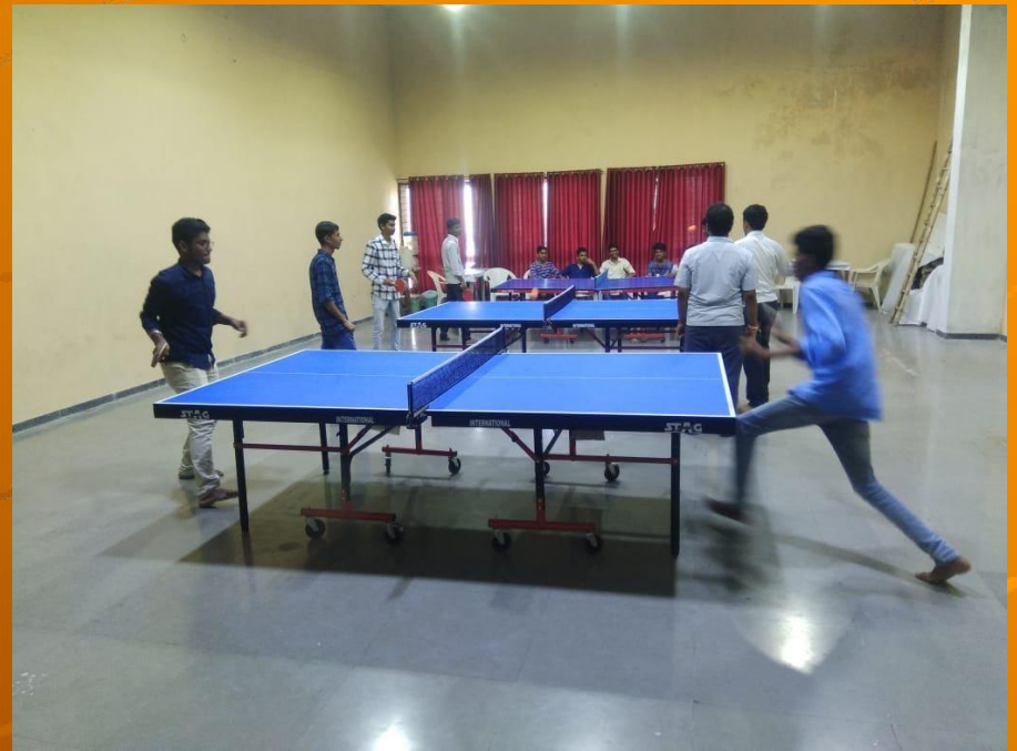
Playing Table Tennis